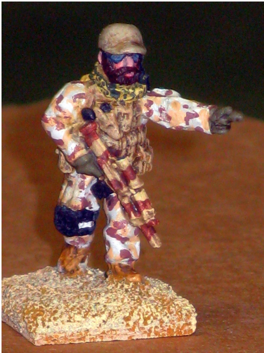
20mm in white metal of Elhiem Figures

The color of the uniforms varies according to wear and exposure to the elements, so do not worry too much about the exact correspondence of colors.